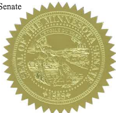
Alice Mann State Senator, District 50